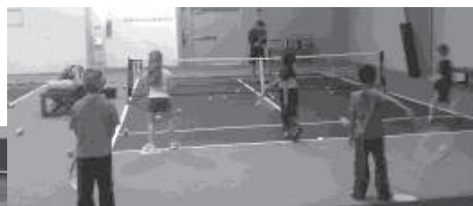
10 & Under Programming on Sport Club Novi's 36' Permanent Courts.