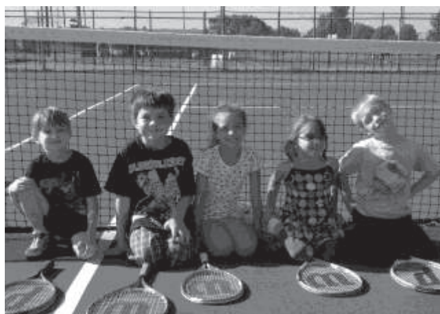
Local programming participants at Champagne Park in Allen Park sitting in front of their updated tennis nets from our recycling program assisting not only their programming but the city's high school players as well.

Wonder what we do with all the equipment we collect? We provide local programming with much needed resources: Racquets, Tennis Balls, Nets, and more!