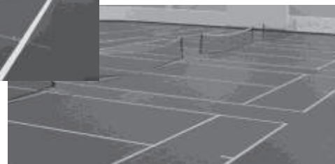
Four dedicated 36' Courts at Franklin Athletic Club.