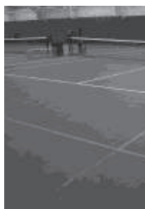
The “Blended Line” Look.

Tournaments for the Novice, Intermediate and Advanced level player. Our goal is to give every new 10 and under tennis player an opportunity to participate in programming that fits their ability level; and a pathway to follow as their skills develop.