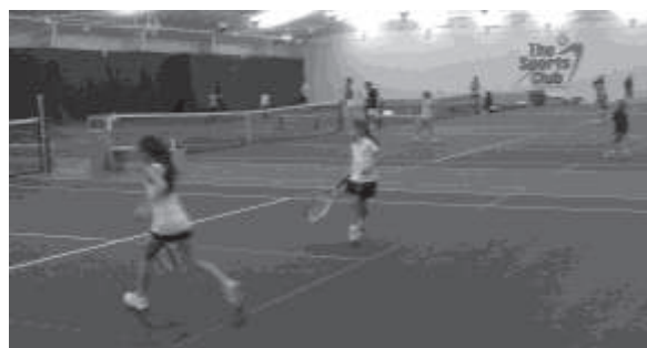
10 & Under Jr. Team Tennis Invitational held at the Sports Club of West Bloomfield.

Participating in their official 10 & under programming in-house, co-ed teams of 4-6 players were invited to a Team Invitational once a month (maximum of four teams per invitational) which included 2 hours of round robin tennis, snacks, beverage and participation ribbons for every player with a low per player cost of $10-$18. USTA Membership is required.