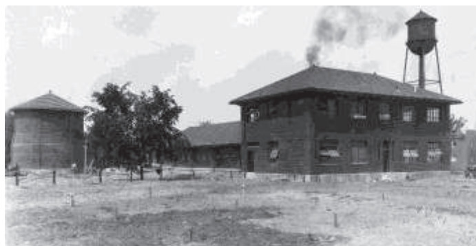
The Pontiac Water Works Building, c. 1919