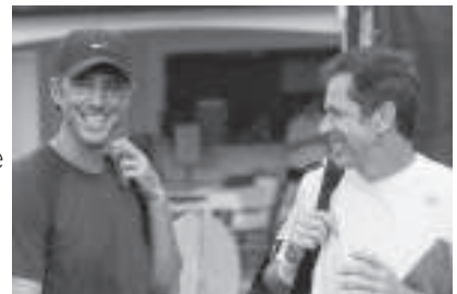
Aaron Krickstein & Jimmy Arias