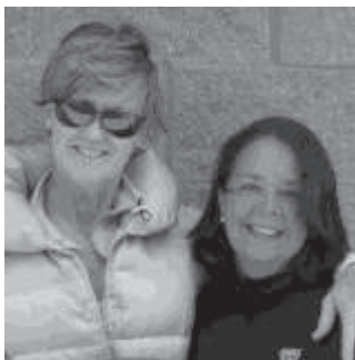
Women's 60s Champions

A special CONGRATULATIONS to our age division winners: Great job, ladies!