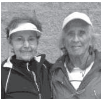
Women's 75s Champions