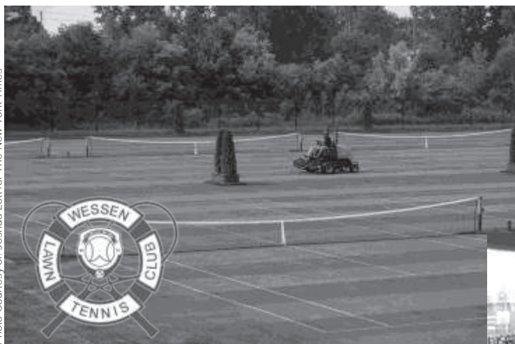
The ryegrass is watered daily and cut to exactly 3/8" tall.