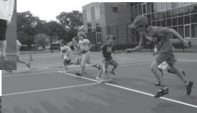
First year program for Hazel Park Recreation at Hazel Park High School (new courts with assistance from a $25,000 USTA Facilities Grant).