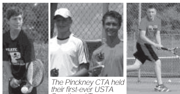
The Pinckney CTA held their first-ever USTA Sanctioned Tournament,