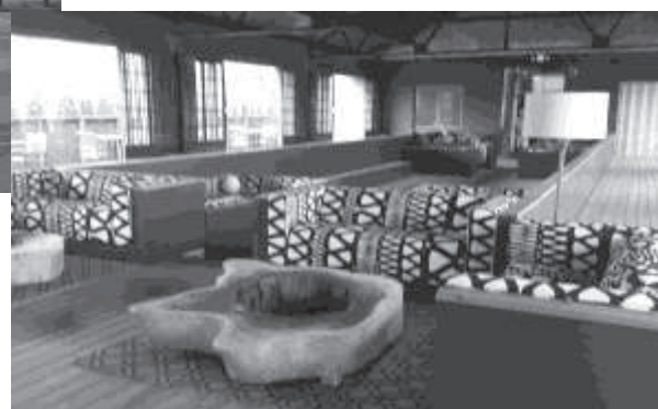
The beautifully restored Water Works building, is now the clubhouse.