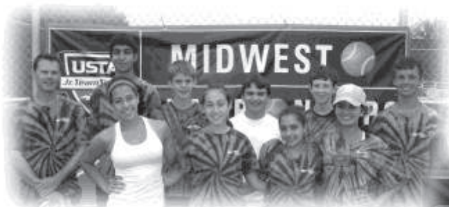
18 INT. LIBERTY MOUNTAIN WOLVES, 4th in Flight.