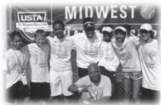
14 ADV. FRANKLIN FALCONS, 3rd in Flight.