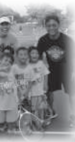
ACES for SARCOMA 10 & U TOURNAMENT: One of the largest 10 & Under Tournaments in the Nation for a great cause!