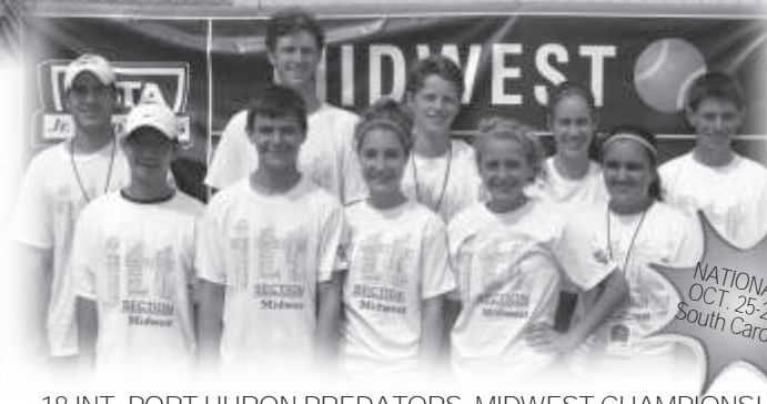
18 INT. PORT HURON PREDATORS, MIDWEST CHAMPIONS!