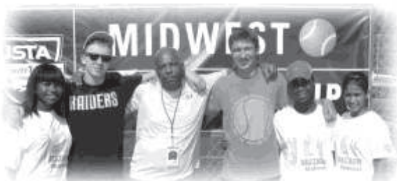
18 ADV. FRANKLIN RAVENS, 5th in Flight.