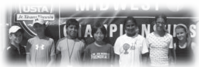
12 INT. CHIPPEWA WARRIORS, MIDWEST FINALISTS!