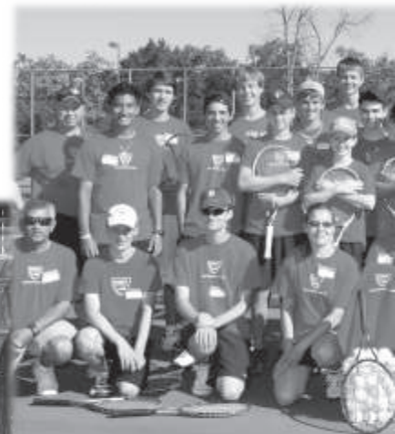
METRO DETROIT YOUTH DAY on B Isle. Instruction to over 700 youth with help from our friends: 40 Volunteers in Grosse Pointe South HS Varsity Playe