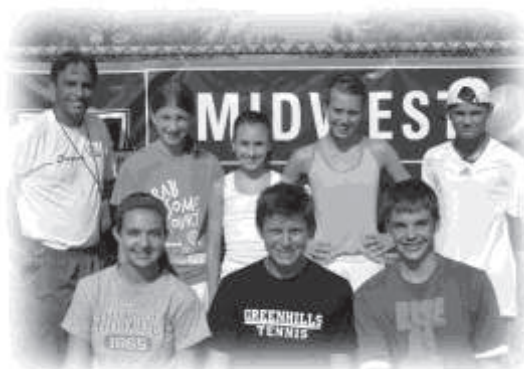
14 INT. CHIPPEWA SERVERS, MIDWEST FINALISTS!