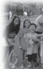
FAST-D (Filipino Leagues—Detroit YOUTH TEAM TE