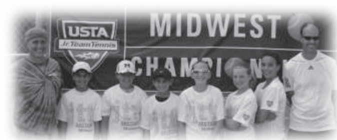
12 INT. LIBERTY SNAPPING TURTLES, MIDWEST CHAMPIONS!

Congratulations to all the coaches, players (and their parents) who traveled to Indianapolis, Indiana the weekend of August 3rd to compete for the Midwest Championship. Four of our seven teams ended up in the finals of their division: The 12 & U Intermediate Liberty Snapping Turtles, defeated the Chippewa Warriors, in a rematch of the District Championship Final, where Liberty "snapped" the title for the second consecutive year. While the 14 & U Intermediate Chippewa Servers (our District Finalist) lost to a tough Indiana opponent, our 18 & U Intermediate Port Huron Predators won their division and will head to National Championships in South Carolina this October!