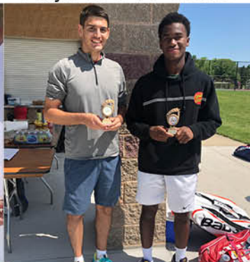
Boys 18 3 rd /4 th Place