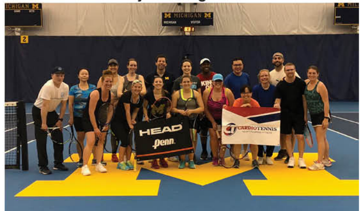
Sets in the City