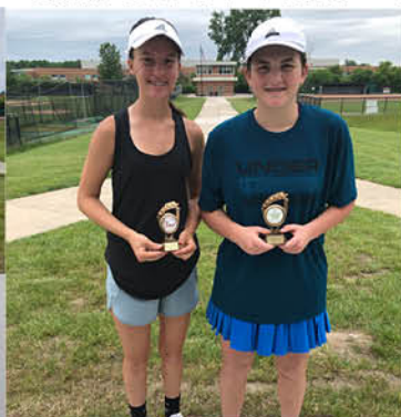
Girls 18 3 rd /4 th Place