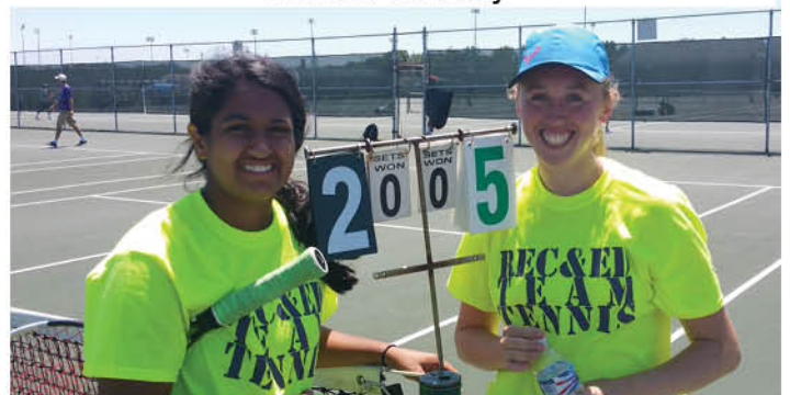
Indiana Playoffs Girls Doubles