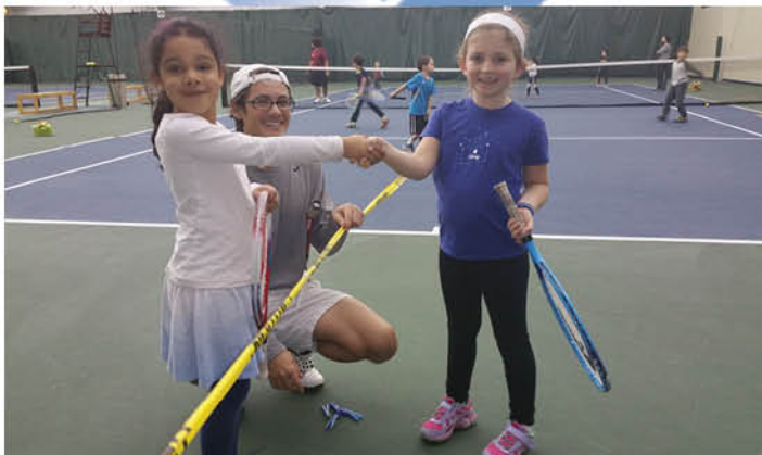
Handshake over Red Ball