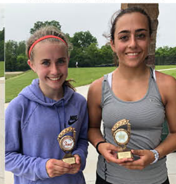
Girls 16 3 rd /4 th Place