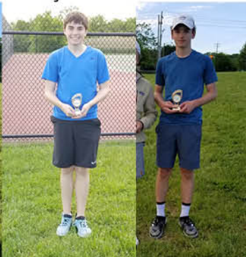
Boys 14 3 rd /4 th Place