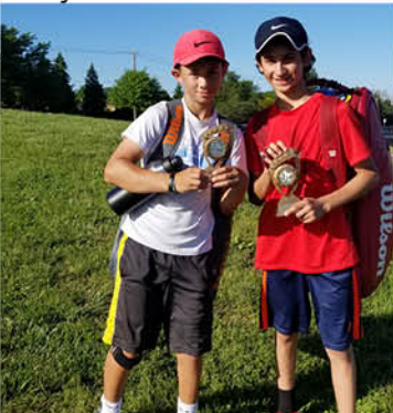
Boys 12 Finalist/Winner