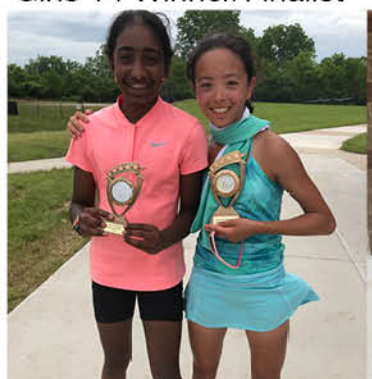
Girls 14 Winner/Finalist