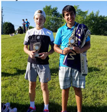
Boys 14 Winner/Finalist