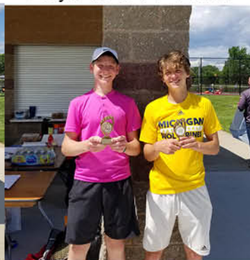
Boys 16 3 rd /4 th Place