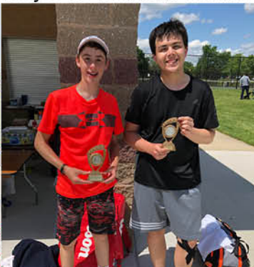
Boys 16 Winner/Finalist