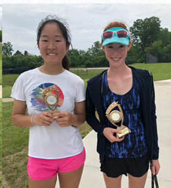
Girls 16 Winner/Finalist