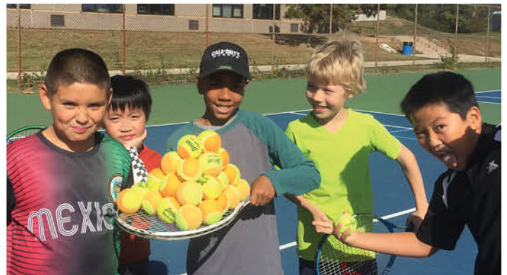
Boys' Orange Ball