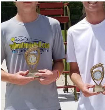
Boys 18 Winner/Finalist