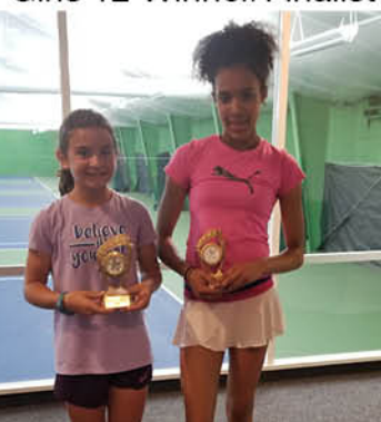
Girls 12 Winner/Finalist