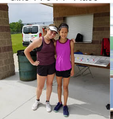
Girls 14 3 rd /4 th Place