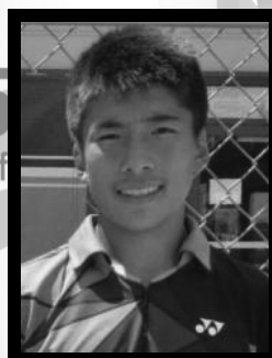
MIDWEST OUTDOOR CLOSED SINGLES CHAMPION! Boys 16s Division