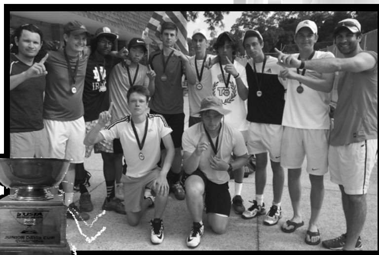
BOYS 18s MIDWEST CUP CHAMPIONS! See page 6

Jr. Team Tennis 12 & Under Intermediate Division MIDWEST CHAM- PIONS!