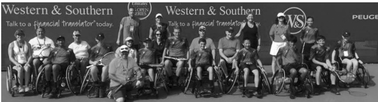
Wheelchair Clinic held at the Western & Southern Open with the help of USTA Staff!